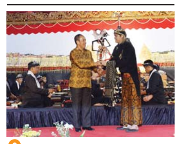
Leather Puppet Show Enliven Lemhannas RI 51th Anniversary