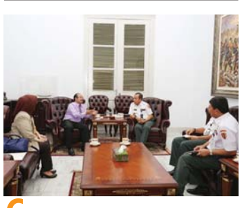
Ombudsman Visits Lemhannas RI