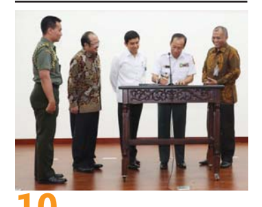
Lemhannas RI Eager to Develop Integrity Zone